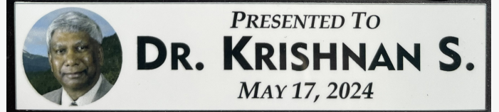
Outstanding Asian American Award - back